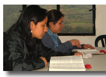
STUDENTS OF FACULTAD TEOLOGICA EVANGELICA

For more information about the work of FTE in Guatemala, please visit missionhousingministries.org