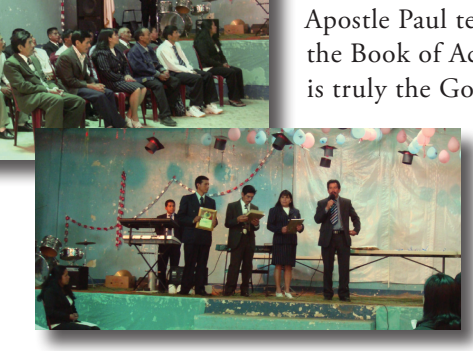
GRADUATION, OCTOBER 28, 2011

rural Mayans had been exposed to Catholicism centuries ago by explorers and missionaries, they were unaware of basic Christian doctrine. We, at Third Millennium, are grateful for the dedicated faculty and